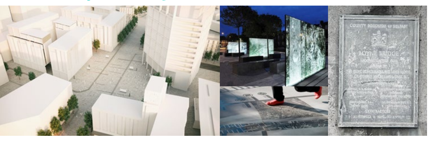
Adaption and Re-use - Reinterpreting the bridge

Historic Interpretation – Paving, timeline and screens